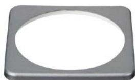
BMV bezel square