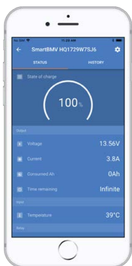
See the VictronConnect BMV app Discovery Sheet for more screenshots