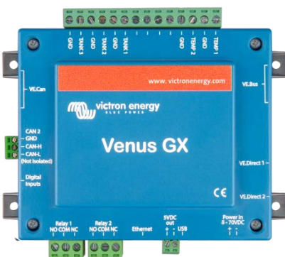
Venus GX with connectors