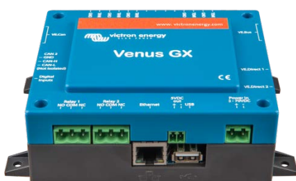
Venus GX front angle