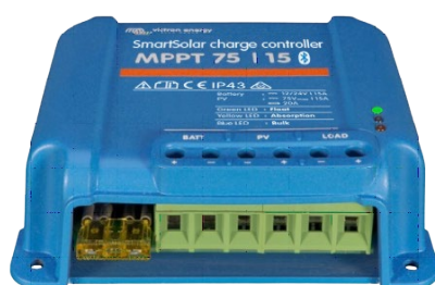
SmartSolar Charge Controller MPPT 75/15