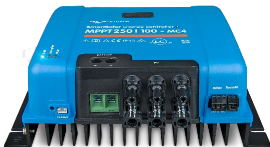
SmartSolar Charge Controller MPPT 250/100-MC4 without display