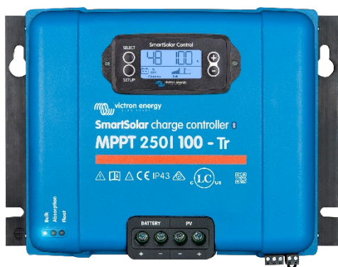
SmartSolar Charge Controller MPPT 250/100-Tr with optional pluggable display