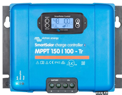
SmartSolar Charge Controller MPPT 150/100-Tr with optional pluggable display