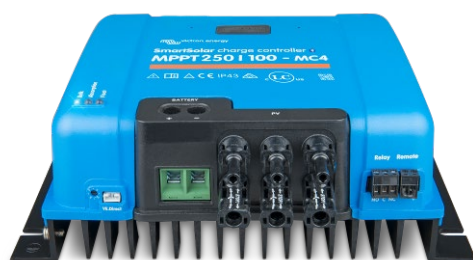
SmartSolar Charge Controller MPPT 150/100-MC4 without display