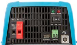
Phoenix 12/375 VE.Direct