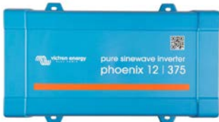
Phoenix 12/375 VE.Direct

250VA – 1200VA 230V and 120V, 50Hz or 60Hz