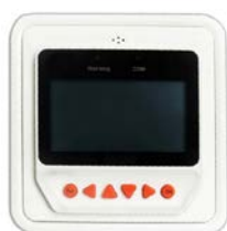
BlueSolar Pro Remote Panel