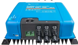
Solar Charge Controller MPPT 150/100-MC4