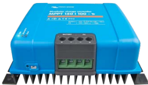
Solar Charge Controller MPPT 150/100-Tr