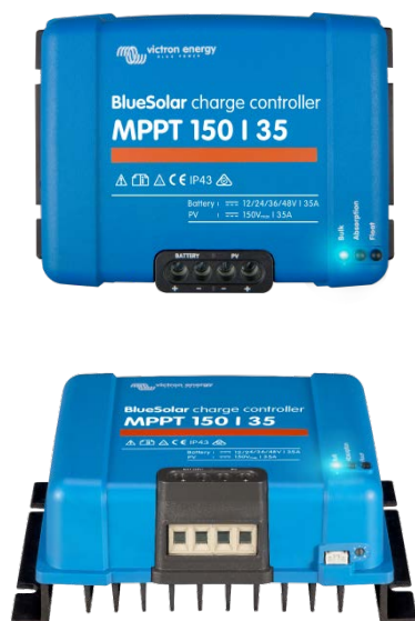
Solar Charge Controller MPPT 150/35