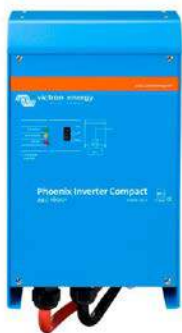
Phoenix Inverter Compact 24/1600

The possibilities of paralleled high power inverters are truly amazing. For ideas, examples and battery capacity calculations please refer to our book 'Energy Unlimited' (available free of charge from Victron Energy and downloadable from www.victronenergy.com ).