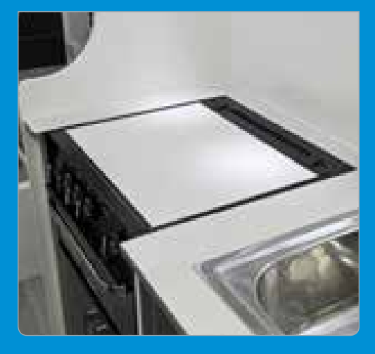
Lid with décor panel