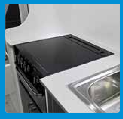
Lid without décor panel

Inquire with your caravan manufacturer or dealer regarding the options for your RV.