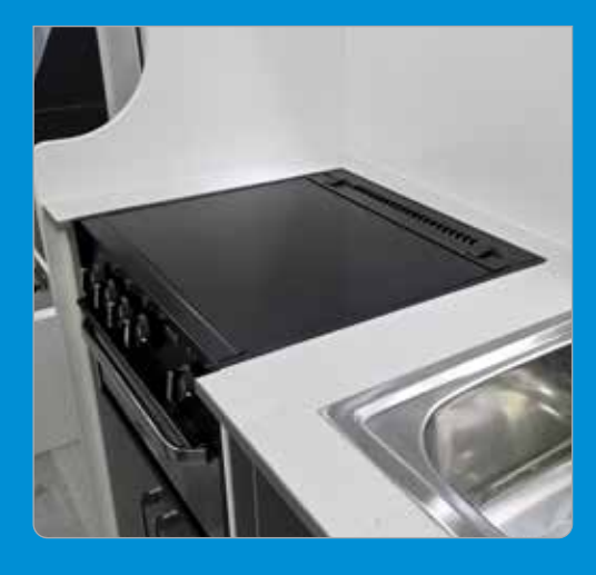
Lid without décor panel

Inquire with your caravan manufacturer or dealer regarding the options for your RV.