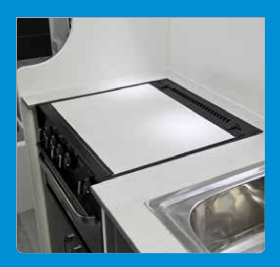
Lid with décor panel