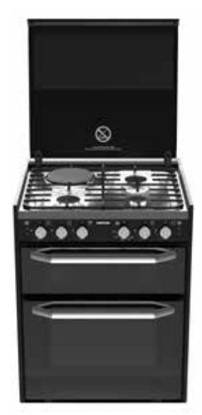
Dual Fuel Fan Forced Oven