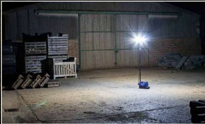
360° area flood lighting