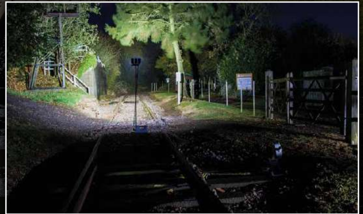
180° directional area flood lighting