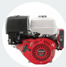
Honda GX engine