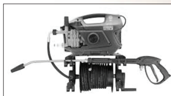
Code: KTRI40418 Wall Support Kit and Hose Reel (optional accessories without hose)