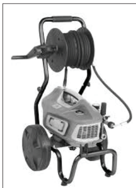
Code: KTRI40419 Hose Reel Kit for Trolley (optional accessories)

The Jetwave® Redback™ is a new semi-professional pressure washer that will revolutionise your domestic duties. Engineered and assembled using only the best quality Italian global components.