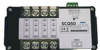
*Optional Simarine Pico Monitor and SCQ50 Shunt