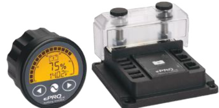
*Standard ePRO Plus Battery Monitor