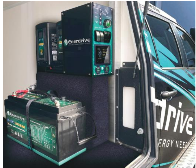
*Driver's Side, Simarine with 2 x Twin USB 2.4A Hi Amp Sockets (battery sold separately).