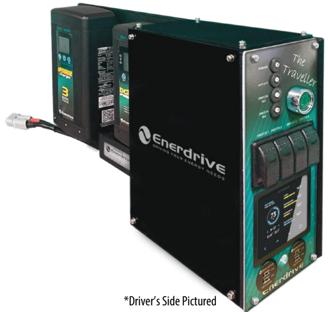
*Driver's Side Pictured