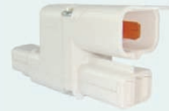
Optional: 1 in 2 out splitter