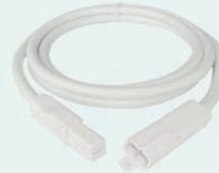
Optional: Link cable in various lengths