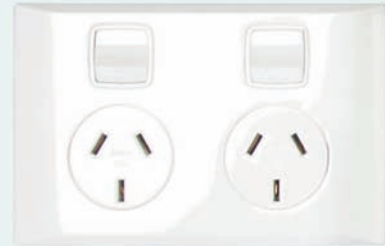
Quality Double Pole Dual outlet GPO with AC Plug & Play Connector

Custom layouts can be arranged subject to applications.