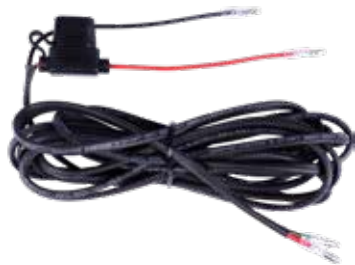
1 x 4-Way Distribution Lead