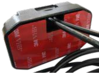
Leads pivoted 90 degrees