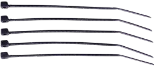
5 x Cable Ties