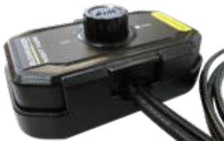
Leads orientated straight out

The Brightness Control Module incorporates a pivoting lead design which provides versatile mounting options. The leads can be orientated straight out of the control module or pivoted 90 degrees to hide them when flush mounting to a surface.