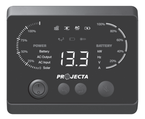
LBM-BT Lithium Battery Monitor