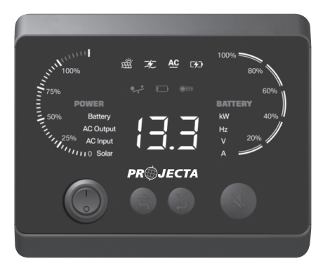
LBM-BT Lithium Battery Monitor