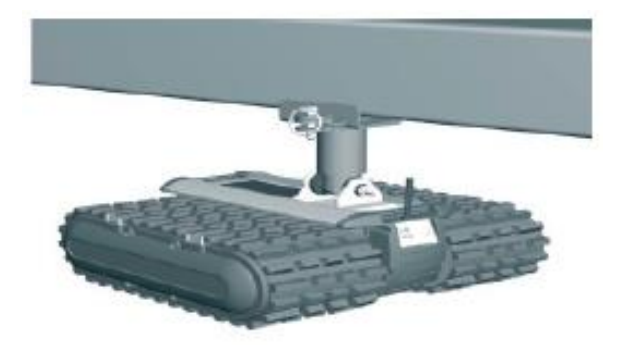
Illustration of the Camper Trolley mounted on the side members of the caravan:

VARIANTS CT2500 is equipped with a tall or low tower with ball joint CT2500 Tall tower CT2500 Height is adjustable Low tower