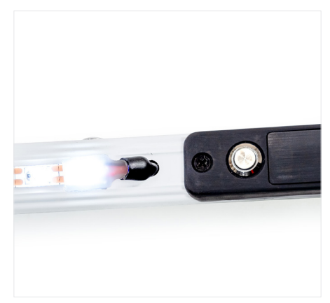
Simple push-button operation.

For full specifications and pricing see our website. For trade & wholesale pricing please speak to one of our sales reps.