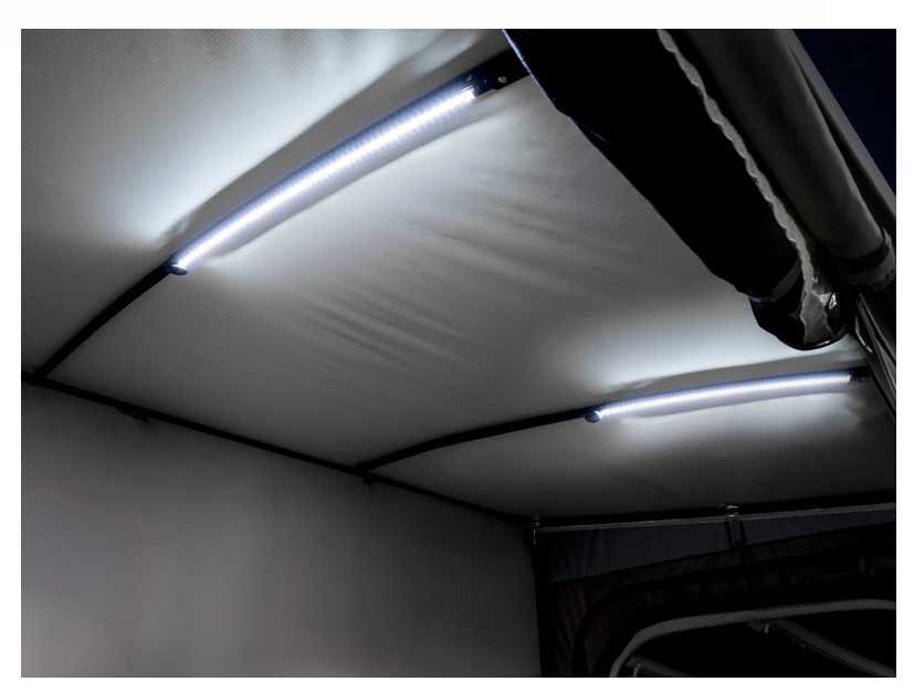
Curved design prevents water-pooling while brightening up your space.