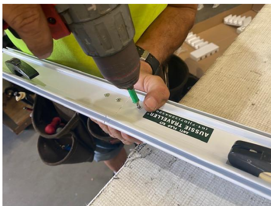
IMAGE 4 SCREW SECTIONS TOGETHER