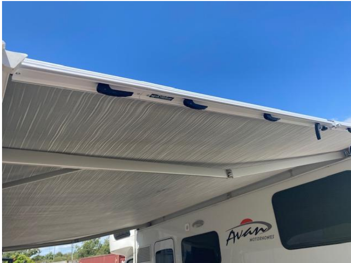
IMAGE 12 CLAMP HANDLES TO COMPLETE