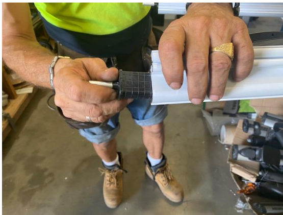
IMAGE 7 ADD SPIGOT END TO 300MM EXTENSIONS