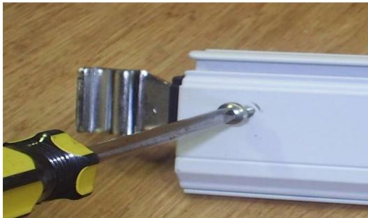
IMAGE 1 REMOVING HOOK END

Remove the original hook-end from the regular AFK and fit an extension arm in its place, making sure that the extension arm extends 100mm from the end of the AFK. (Image 1 and Image 2).