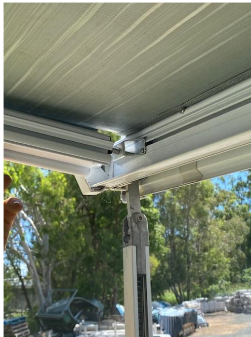
IMAGE 11 SPIGOT END