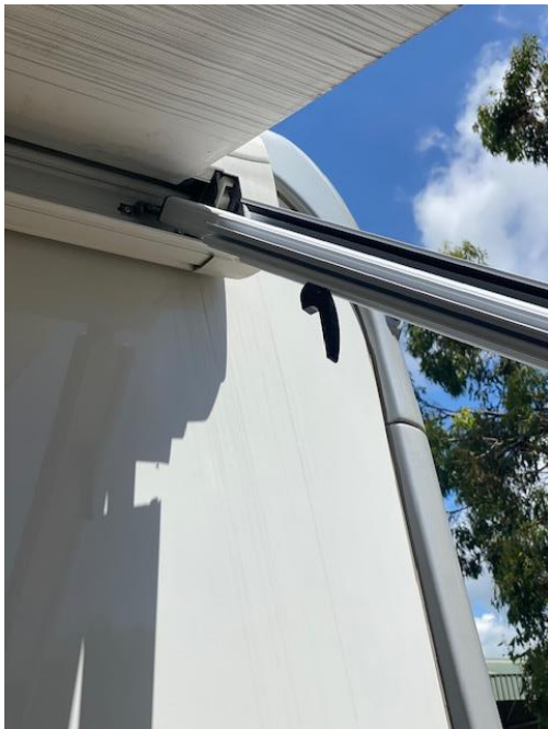
IMAGE 10 HOOK END

Ensure handles are all on open position. Slide hook end into bracket on the van side (image 10). Line Anti-Flap Kit up with Outrigger Spigot bracket and slide into hole (image 11). Clamp handles together to secure Anti-Flap Kit to complete set up (image 12).