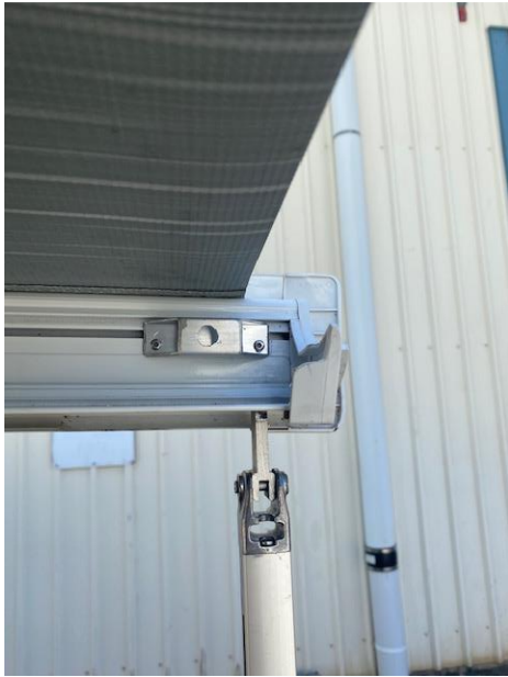
IMAGE 9 MOUNTING OUTRIGGER SPIGOT BRACKET

For Thule 8000 it will be required to pop rivet a small box-section bracket to the outrigger that has a hole for the AFK spigot to slot into (image 9).