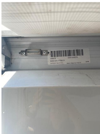
IMAGE 8 PLACING MOUNTING BRACKET

For a side-mount awning, fit the AFK mounting bracket inside the cassette housing. The outer edge of the mounting bracket should be in line with the fabric edge. Generally, the best position to fix the mounting bracket is 20mm below the fabric (Image 8) on both the left and right sides of the cassette housing. However, in some cases there will be tracks or other interferences, in which case, the closest fit (to 20mm) obtainable should be used.